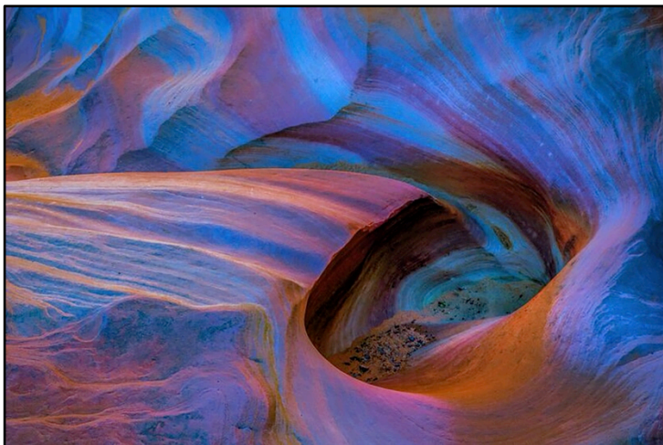
David Kepley "Modern Sculpture"

Photographed in a dry creek at Valley of Fire State Park near Las Vegas. Water eroded the sandstone, revealing different colored layers of rock, pinks, blues, oranges. To me it looked like a nautilus shell.